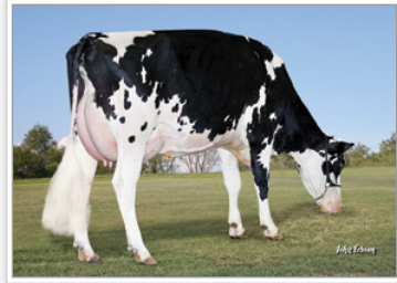
Roorda Shot 12150