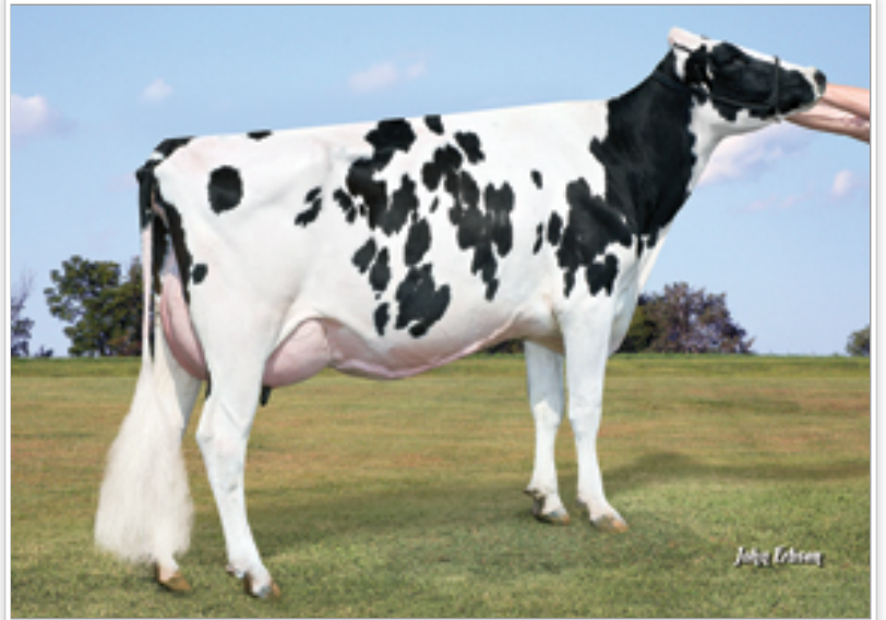
Goff Shot 36017